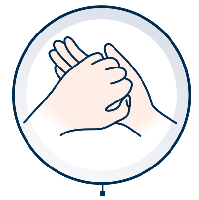
RUB FINGERTIPS OF EACH HAND IN OPPOSITE PALM.