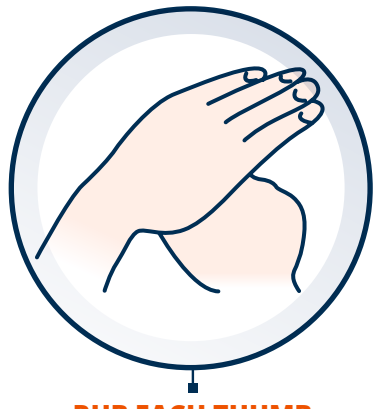
RUB EACH THUMB CLASPED IN OPPOSITE HAND.