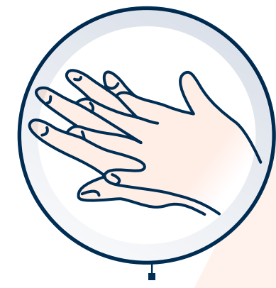
RUB BACK OF EACH HAND WITH PALM OF OTHER HAND.