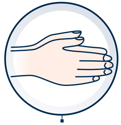
RUB HANDS TOGETHER, PALM TO PALM.