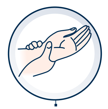
RUB EACH WRIST CLASPED IN OPPOSITE HAND.