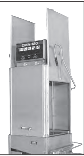
Large 27" door opening accommodates lager items and utensils.